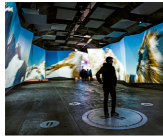
360° Cinematic Experience