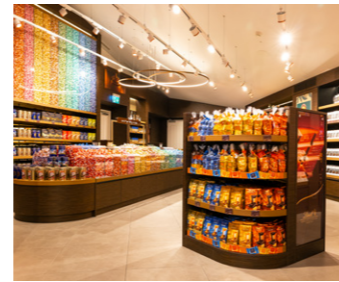
Lindt Chocolate Shop