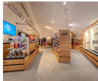
Top of Europe Shop