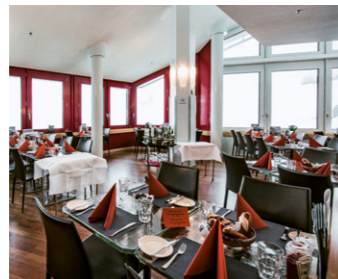
Halal Menu available